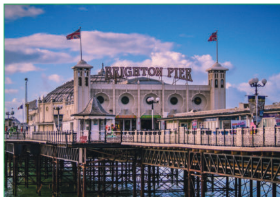
Adapted from: https://www.buckswoodsummerschool.com/summer-school-in-the-uk (abgerufen am 30.03.2023, adaptiert). https://www.travelworks.de/summer-school-england/buckswood-school.html (abgerufen am 30.03.2023, adaptiert).

Our Activity and Excursion Programme for 2024 is a lot of fun! Our programme consists of two full day excursions and two half day excursions. Full day excursions: 8.30 am – 7 pm Half day excursions: 2 – 6 pm Places to see: London, Brighton, Windsor, Hastings, as well as other historical and cultural locations.